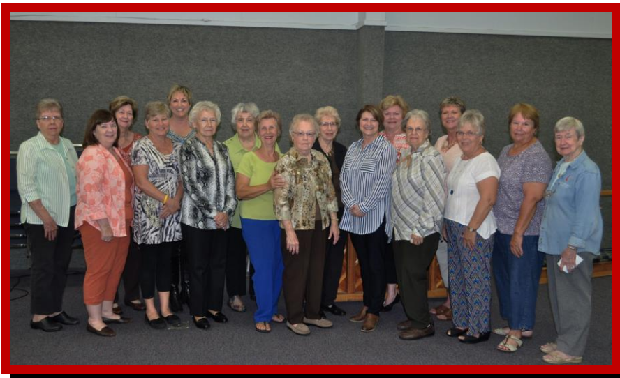
2017 UMW OFFICERS

I pray that this Advent season, this time of preparation for the arrival of our Savior, will be a very special time in your life...a time of reflection, of patience, of anticipation, and, yes, of waiting.